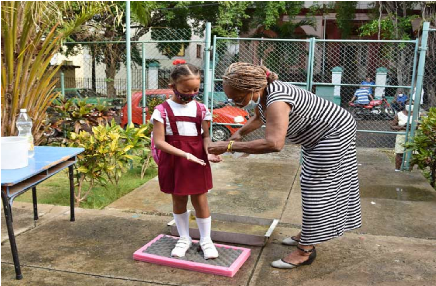
Special hygienic measures at school entrance.

Havana, November 2 (RHC)— Cuba's capital resumes Monday the 2019-2020 school year to end the academic cycle interrupted in March due to the Covid-19 pandemic. Some of the other provinces are beginning the new school year.