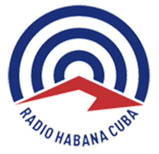
Radio Habana Cuba

https://www.radiohc.cu/en/noticias/internacionales/195323-russian-president-urges-venezuelan-oppositionleader-to-dialogue