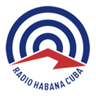
Radio Habana Cuba

https://www.radiohc.cu/en/noticias/internacionales/242142-russia-resumes-nord-stream-2-pipeline-projectdefying-us-sanctions