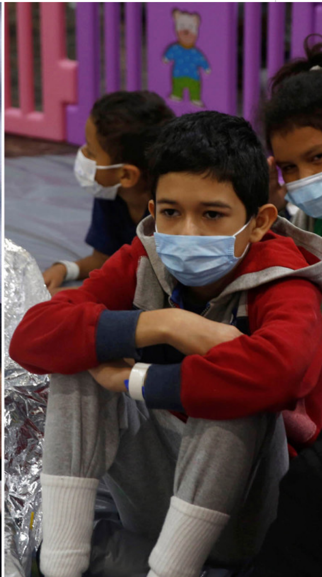
Texas Governor Greg Abbott to shut down shelters for migrant children

Austin, June 3 (RHC)-- In the United States, Texas Republican Governor Greg Abbott is attempting to