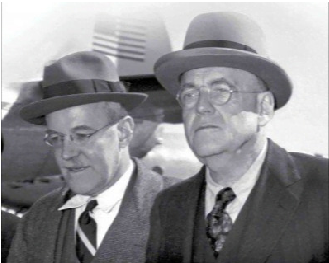
Brothers John Foster and Allen Dulles