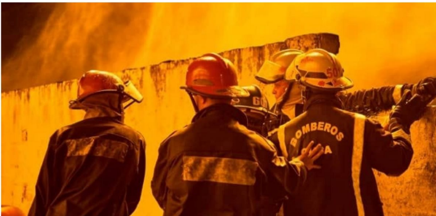
The Cuban government has thanked the U.S. Embassy in Havana for donating specialized equipment for firefighters.

Havana, January 14 (RHC)-- The Cuban government has thanked the U.S. Embassy in Havana for donating specialized equipment for firefighters.