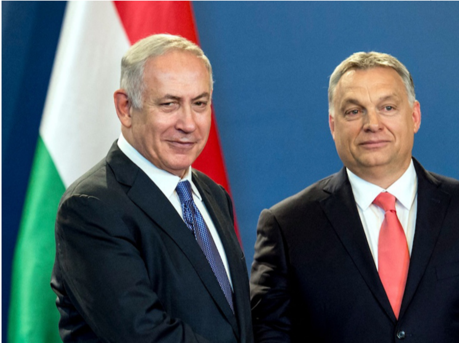
Benjamin Netanyahu and Viktor Orbán shake hands as they give a joint press conference in Budapest, Hungary in July 2017 ( File photo )

As a member state of the ICC, Hungary is obliged to arrest Netanyahu upon his arrival in the central European country and surrender him to the court. However, Orban and his administration have made it abundantly clear that they will not comply with the ICC's ruling and requirements.