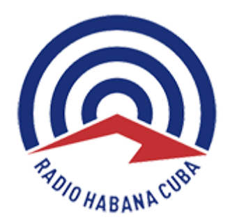
Radio Habana Cuba

https://www.radiohc.cu/en/noticias/internacionales/381721-palestinian-school-comes-under-attack-by-illegalisraeli-settlers-in-occupied-west-bank