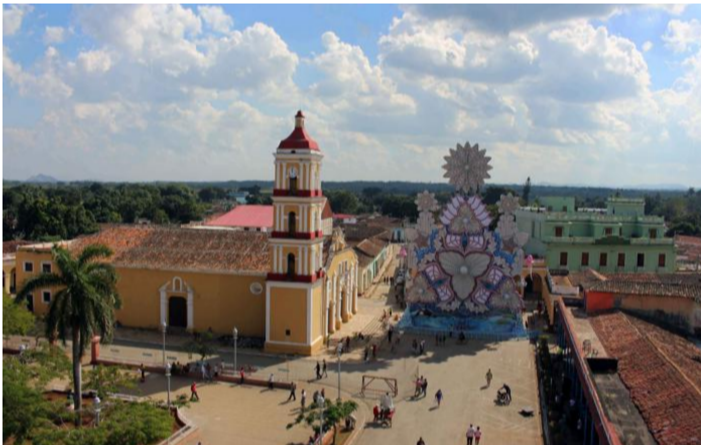
Remedios Awaits Its 510th Anniversary