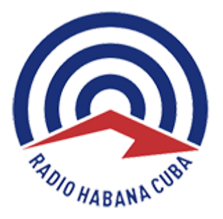
Radio Habana Cuba

https://www.radiohc.cu/index.php/en/noticias/internacionales/248314-nato-to-increase-troops-in-iraq