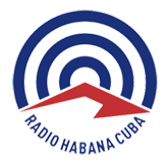
Radio Habana Cuba

https://www.radiohc.cu/index.php/en/noticias/nacionales/301804-cuban-president-reiterates-support-toprovince-most-affected-by-hurricane-ian