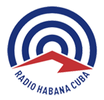
Radio Habana Cuba

https://www.radiohc.cu/index.php/en/noticias/nacionales/333791-cuba-commemorates-50th-anniversary-offidel-castros-visit-to-vietnam